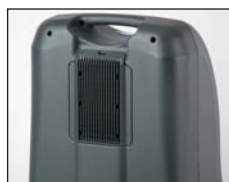
Filter access and adapter storage.